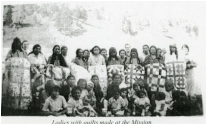
Ladies with quilts made at the Mission.

This photo appears in the book Border to Border published by the Montana State Historical Society on history of quilts and quilters of Montana.